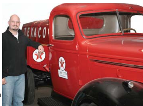
The truck that started it all has been assigned to parade duty.