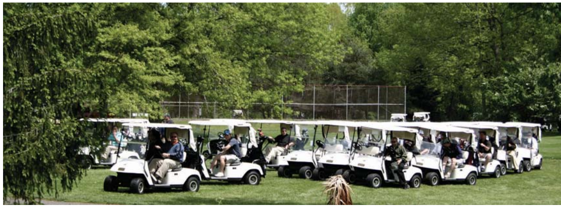
Carts line up for a wonderful day on the fairways.